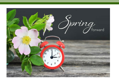
Daylight Savings Sunday, March 13, 2022 at 2:00 a.m.