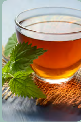
HOMEMADE TEA/TEA BAGS