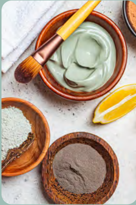
HOMEMADE JAPANESE FACE MASK