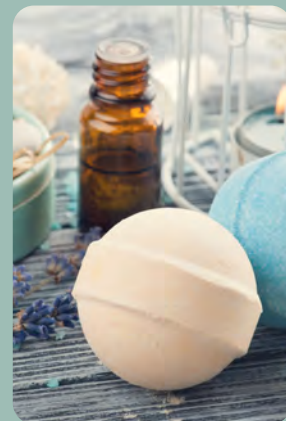
ESSENTIAL OIL BATH BOMB

1140 HARRY SYKES WAY, LEXINGTON, KY 40504